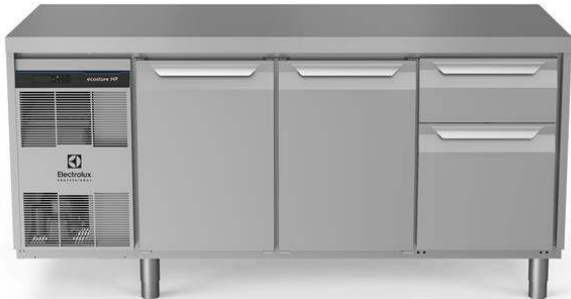
710041 (EH3HBAAD) 2-door, 1/3 and 2/3 drawer Refrigerated Counter 440lt, -2+10°C, AISI 304